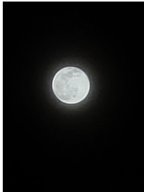
Full Moon March 7, 2023