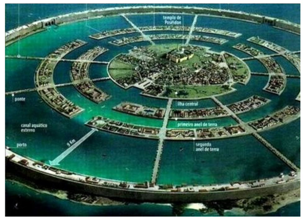
Graphic of Atlantis http://tm2012.triciamccannonspeaks.com/atlantis-the-lost-civilization/

https://www.galacticfacets.com/ancient-technology.html