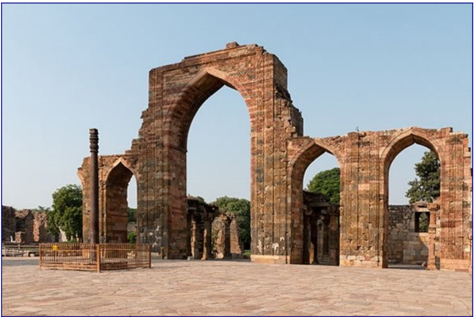
The Incredible Rust-Resistant Iron Pillar of Delhi

https://www.ancient-origins.net/ancient-places-asia/incredible-rust-resistant-iron-pillar-delhi-001503 News