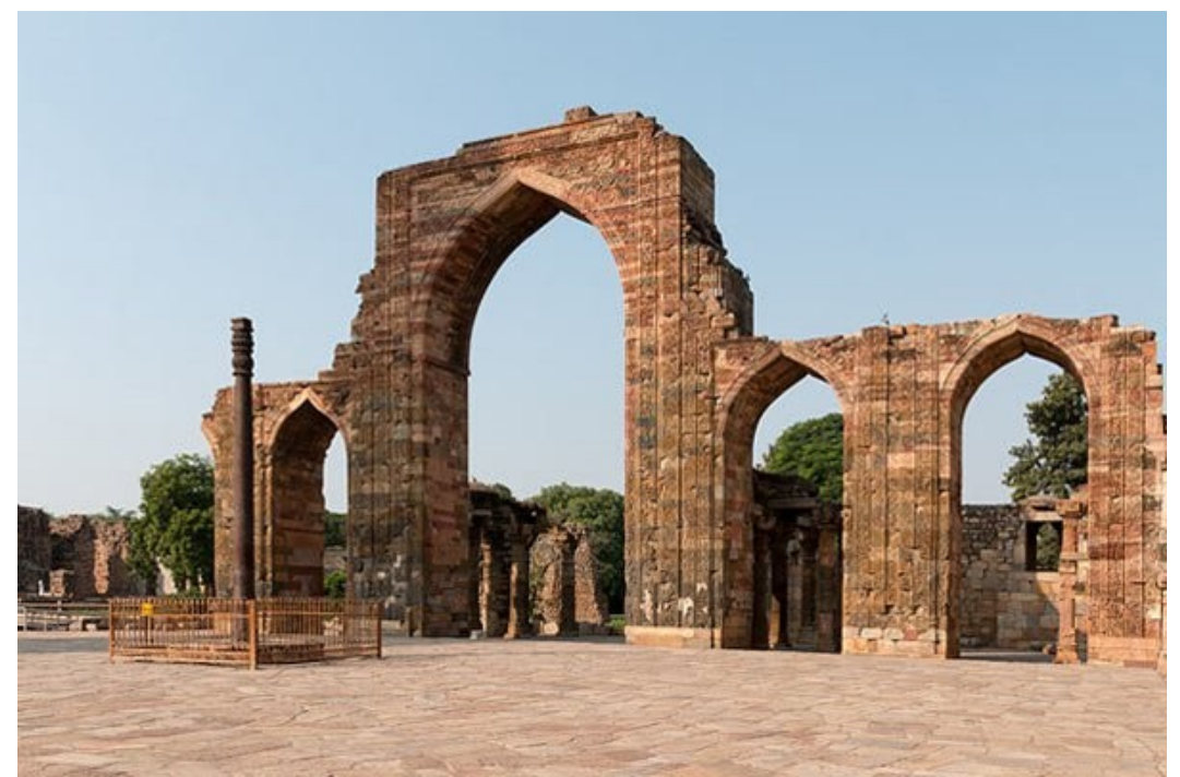
Iron Pillar of Delphi in India http://www.ancient-origins.net/ancient-places-asia/incredible-rust-resistant-iron-pillar-delhi-001503