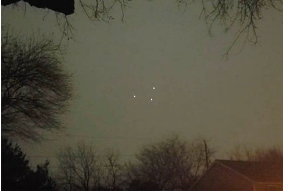
FROM Lord Rama: Taken in Florida