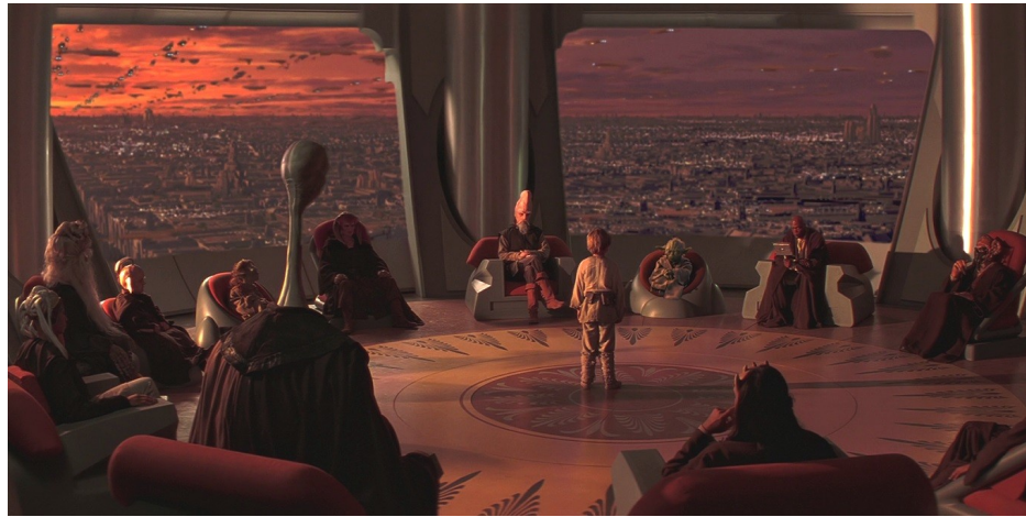
Jedi Council