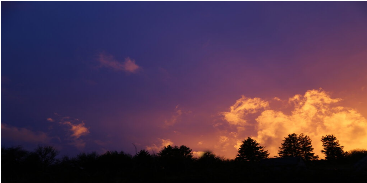
Sunset in Ballydesmond, Ireland

It's based on a beautiful poem by Walt Whitman, "Song of the Open Road" from his wonderful self-published book, Leaves of Grass , which was, at the time it was published, considered interesting, but which is now considered a classic of US literature.