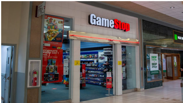
FILE PHOTO. The GameStop store seen inside the Susquehanna Valley Mall, January 27, 2021.

AUDIO: Keiser Report Companies pour money into China (E1652) 2021-01-30