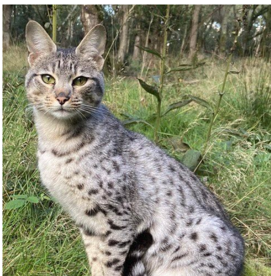
Curly of Larry, Curly & Mo!

Meanwhile, Prime Minister Netanyahu will be held to account along with his cadre of the Dark Side by the good folks in the Israeli government who are not Zionists. The whole Zionist idea is part of the old matrix. It is OVER!!! This is not a joke! There are Galactic Commanders, who, as given the orders by the Ashtar Command, will contain the Dark Ones who will be handed over to Mother Sekmet and the Paschats. They will boarded onto galactic cargo starships headed for Dracos in the Orion Constellation. See you in the Light of the Most Radiant One! Sat Nam! Namaste! Blaze the Violet Fire! "