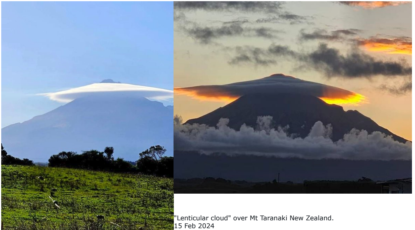
"Lenticular cloud" over Mt Taranaki New Zealand. 15 Feb 2024 Sunrise photo followed by an hour later.