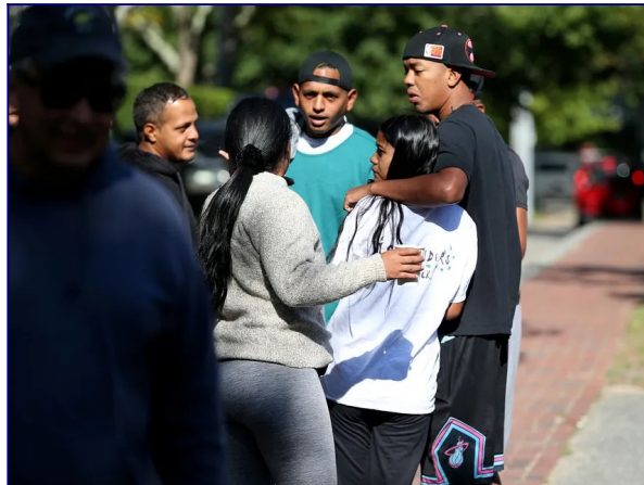
A group of migrants huddle on a sidewalk in Martha's Vineyard, MA on September 15, 2022

Popular Information has obtained documentary evidence that migrants from Venezuela were provided with false information to convince them to board flights chartered by Florida Governor Ron DeSantis (R). The documents suggest that the flights were not just a callous political stunt but potentially a crime.