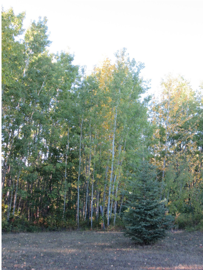
2022-09-22 Early Fall in one part of Alberta!

equinox energy which is transforming the hearts of all people. Goddess is here! Let's dance with the energy of the changing of the season. "Whatever the problem is, Love is the answer. See you in the Light of the Most Radiant one! Sat Nam! Namaste! Blaze the Violet Fire!!!"