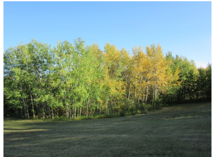
Two strains of poplar trees