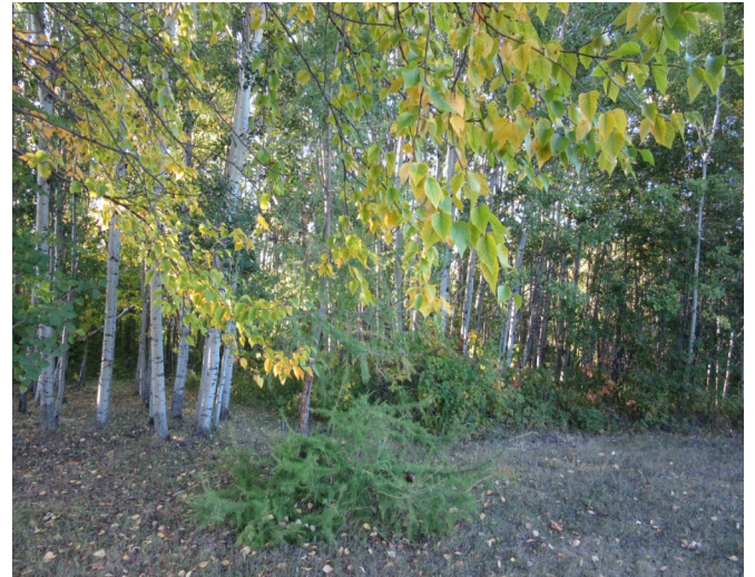
Birch trees brooding over a mal-formed Tamarack