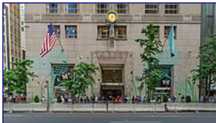
Fifth Avenue flagship store in 2019