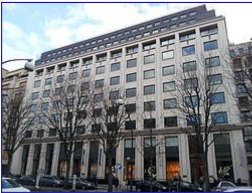
LVMH headquarters in Paris , France

BACKGROUND: LVMH Moët Hennessy Louis Vuitton (French pronunciation: [ moɛt ɛnesi lwi vuɪto ]), [1] commonly known as LVMH , is a French multinational corporation and conglomerate specializing in luxury goods , headquartered in Paris , France. [3] The company was formed in 1987 through the merger of fashion house Louis Vuitton (founded in 1854) with Moët Hennessy, which was established after the 1971 merger between the champagne producer Moët & Chandon (founded in 1743) and the cognac producer Hennessy (founded in 1765). [4][5][6] LVMH controls around 60 subsidiaries that each manage a small number of prestigious brands, 75 in total. The subsidiaries are often managed independently, under the umbrellas of six branches: Fashion Group, Wines and Spirits, Perfumes and Cosmetics, Watches and Jewelry, Selective Distribution, and Other Activities. The oldest of the LVMH brands is wine producer Château d'Yquem , which dates its origins back to 1593. [7]