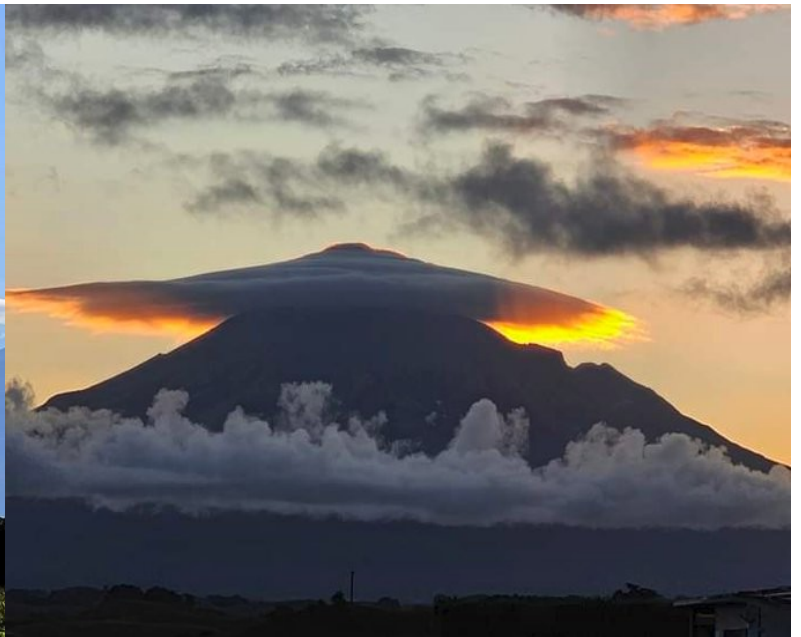
"Lenticular cloud" over Mt Taranaki New Zealand. 15 Feb 2024

Sunrise photo followed by an hour later.