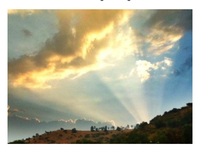
The Sun Shining Through . . .