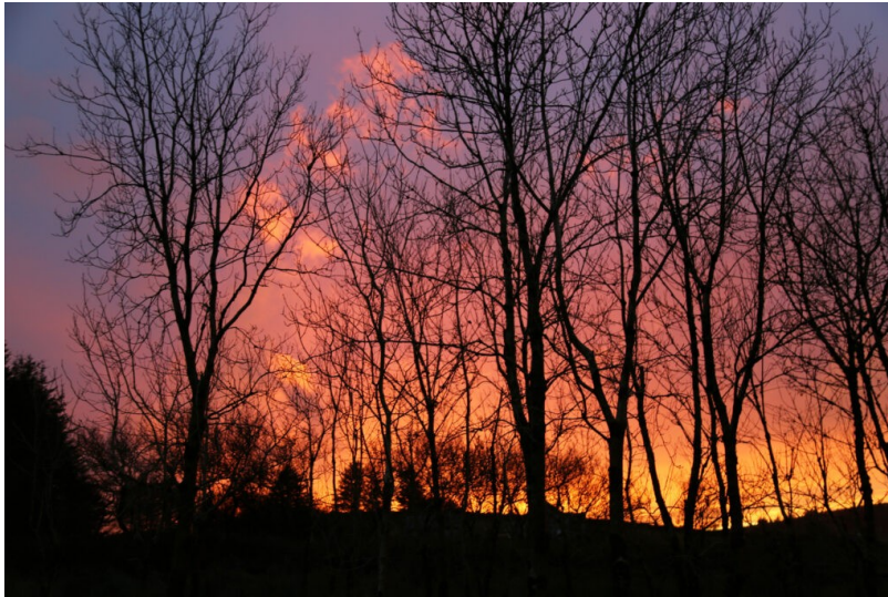
Sunset in Ballydesmond, Ireland in the aftermath of high winds and torrential rain.

COR: Does asking “When” slow things down, I wonder?