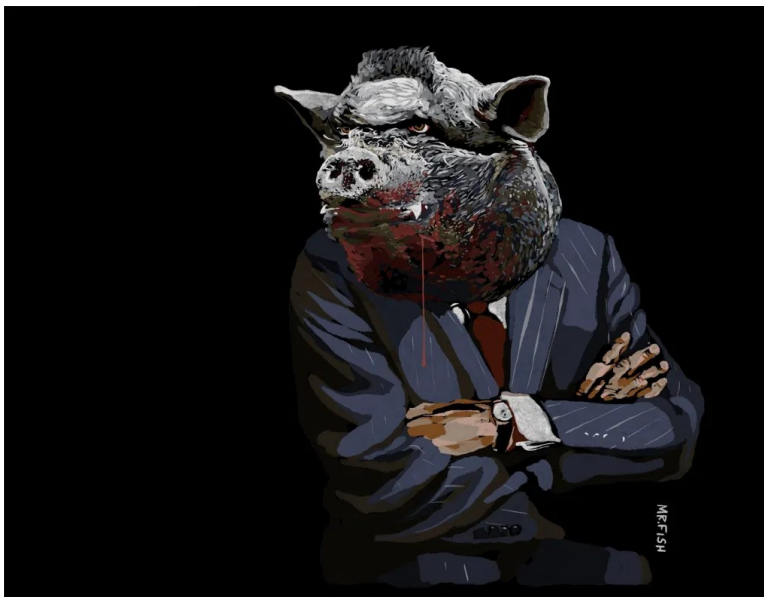
Original illustration by Mr. Fish

The ruling elites, despite the accelerating and tangible ecological collapse, mollify us, either by meaningless gestures or denial.