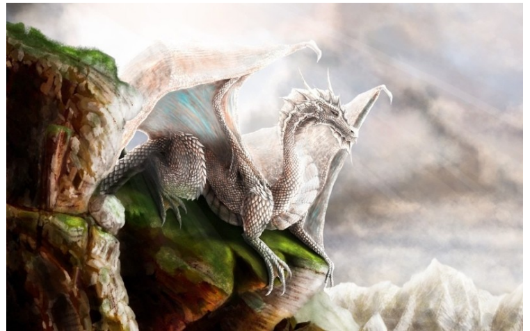
Lord Rama's Friend: Ruth the White Dragon