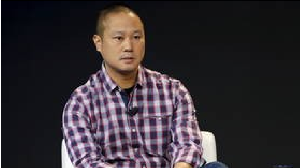
FILE PHOTO: Tony Hsieh, former CEO of Zappos

28 Nov, 2020 09:17 / Updated 1 month ago