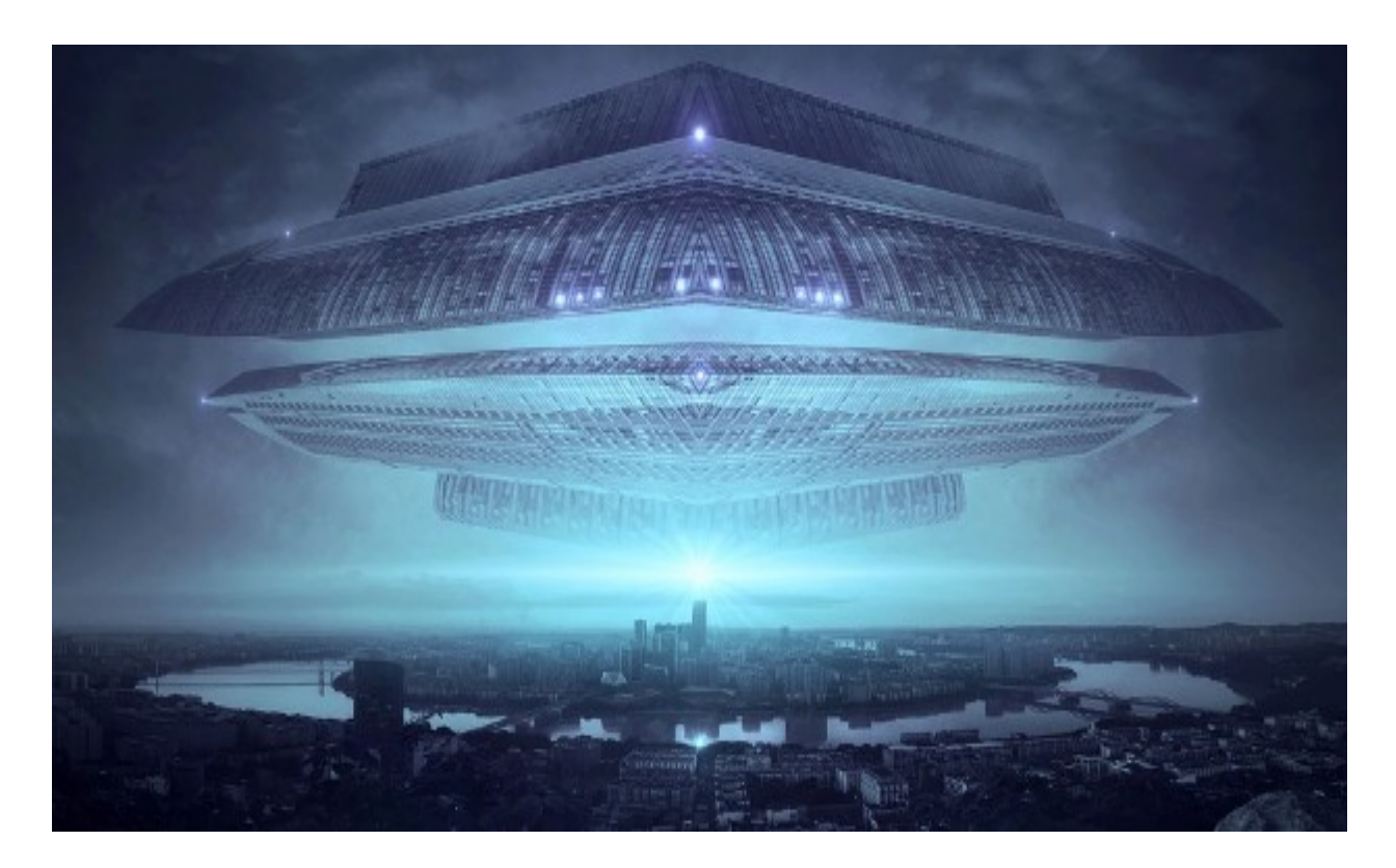
From Lord Rama: Large Transport Ship of The Federation...