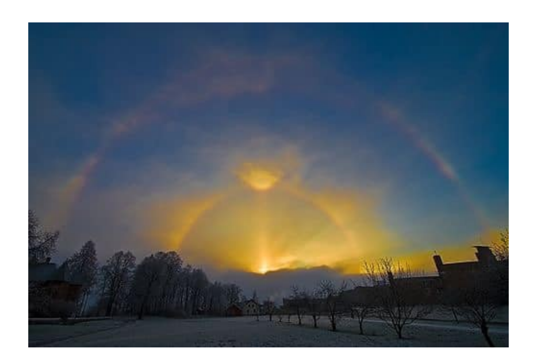
From Lord Rama: Sunrise over California

2023-08-31 Rama's White Knight Report AUGUST 31, 2023 5 / 5